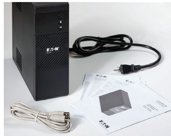
What's in the box? 5S box contents include, 5S UPS, USB cable and user manuals