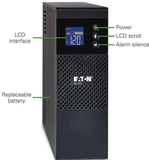
Model displayed above: 5S1500LCD